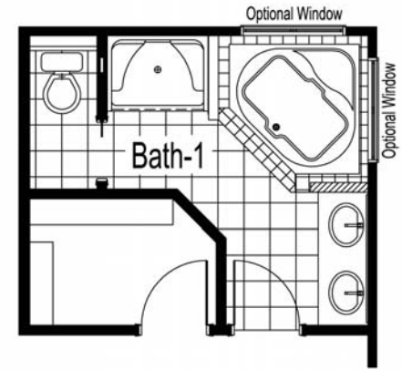
Alt. Master Bath-1